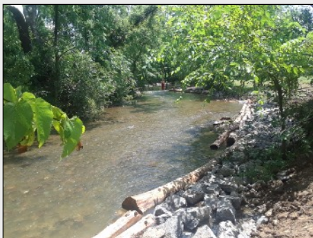
The banks of Buffalo Creek along Koons Trail in Mifflinburg were restored this summer.

The Koons Trail in Mifflinburg at the covered bridge on North 4th St. was closed for a couple weeks this summer for a stream restoration project on Buffalo Creek. While the beauty of the trail still suffers from