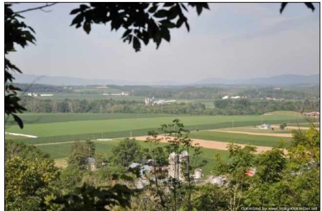
...and to natural wonders closer to home—such as the view from Dale's Ridge Trail.

There is a challenge being mounted to the federal government's preserving and making available such experiences to all of us. They hold such places in trust for everyone and we believe it should be so. Some of the protections for our natural world and its wonders have originated and do originate with organizations like the Merrill Linn Conservancy. They stand in the way of "privatization," which probably means really, "commercialization." A fare-paid elevator ride to see Mesa Verde or explore Mammoth Cave would not substitute for any experiences such as we actually had. The appropriate view of our sharing these rare experiences begins right here at home in our lovely, if tamer, landscapes saved by the Conservancy.