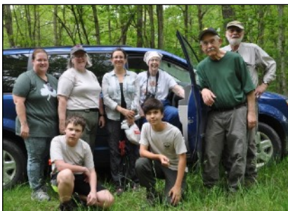
Priestly Unitarian Fellowship and Scout Troop 642 members

With the departure of the Priestley Unitarian Fellowship as maintainers of the Merrill Linn Trail after 25+ years of service, their role has been assumed by Scout Troop 642 from Watsonstown, Pa. Members