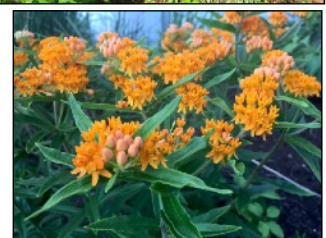
Scarlett beebalm, nodding wild onion, blue false indigo, and butterflyweed each have their season at the Conservancy's native plant garden.